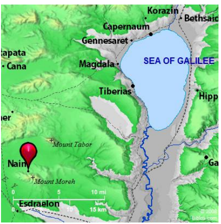
The story from Nain